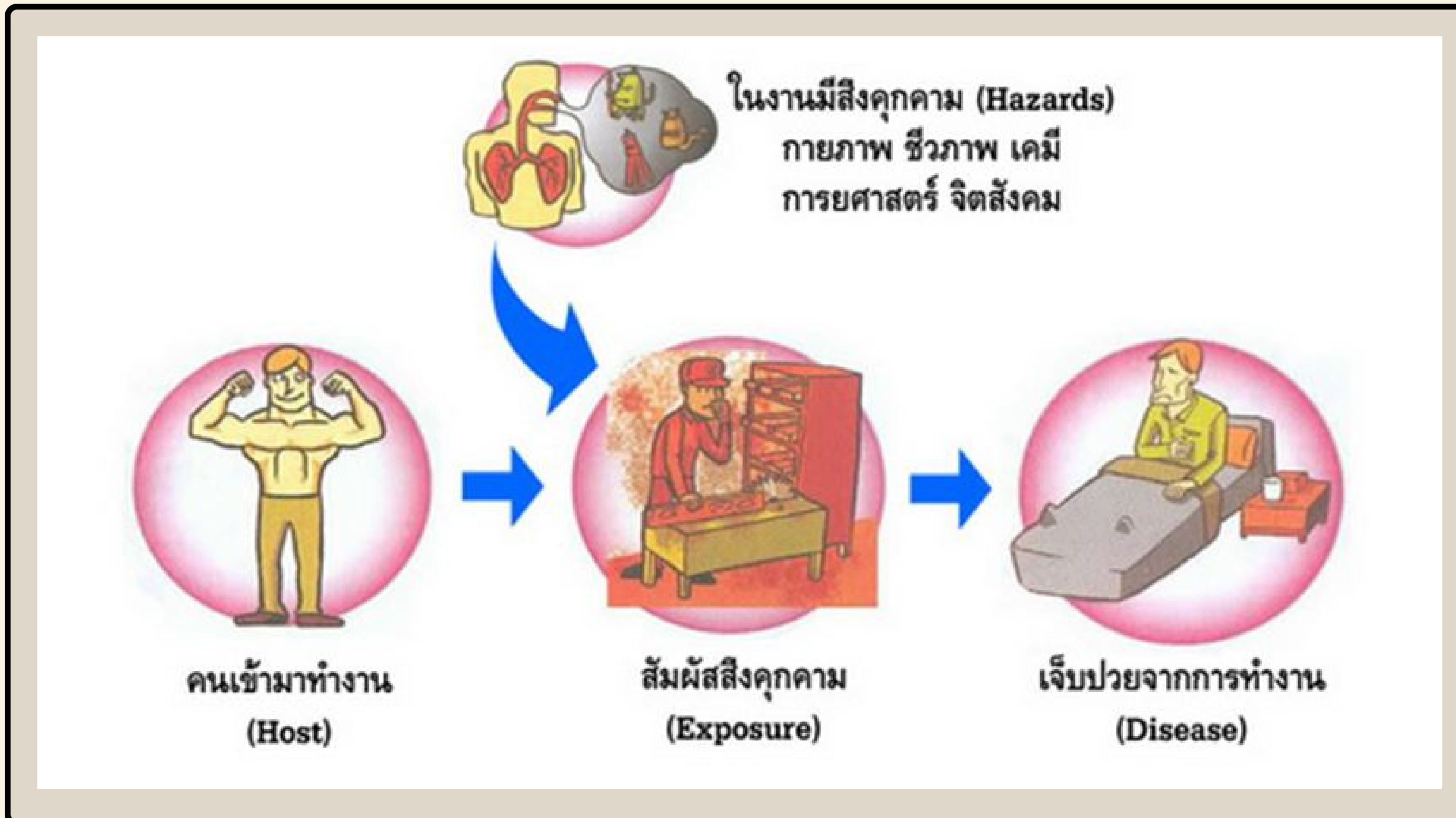
Picture reference: Bureau of Occupational and Environmental Diseases, Department of Disease Control