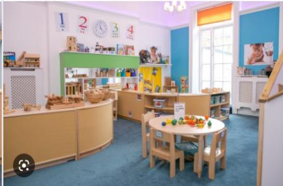
Childrens Nursery in Shepshed - Children 1st Day Nurseries