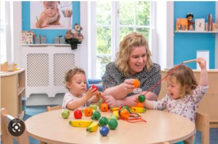
Childrens Nursery in Shepshed - Children 1st Day Nurseries